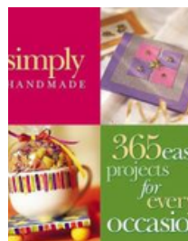
Simply Handmade: 365 Easy Projects for Every Occasion